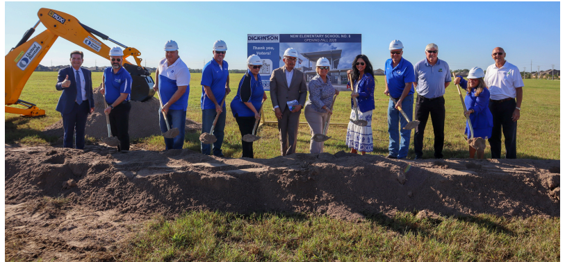
The Board of Trustees marked the start of construction of Elementary #8 at a Groundbreaking Ceremony on September 30.